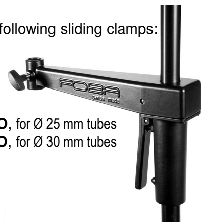
CEONO , for Ø 25 mm tubes SAONO , for Ø 30 mm tubes

... and in the following sliding clamps: