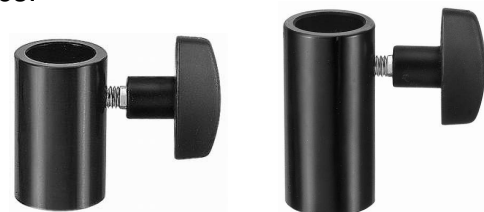
CEHUA Bottom: 3/8" inner thread

ARTIU S fits in the following exchange sleeves: