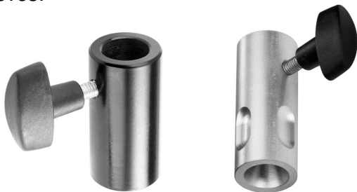
CEHUE Bottom: 3/8" inner thread

ARTIU S fits in the following exchange sleeves: